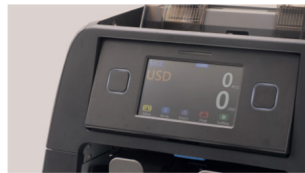
Display angle adjustment